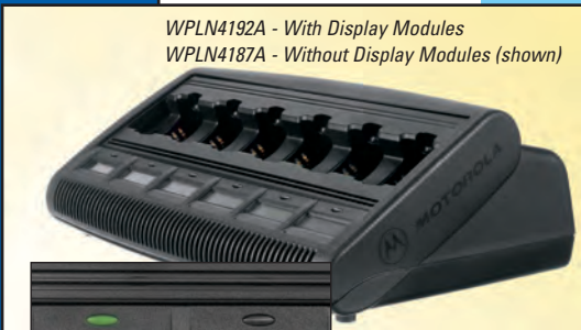
WPLN4192A - With Display Modules WPLN4187A - Without Display Modules (shown)

RLN5382A - Individual IMPRES Display Module for WPLN4108BR (Software Version 1.3 or later)