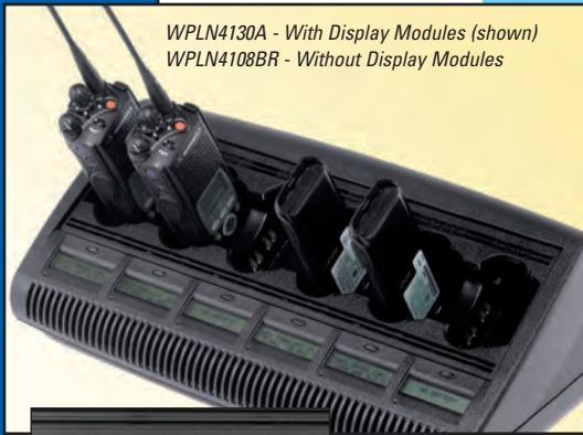
WPLN4130A - With Display Modules (shown) WPLN4108BR - Without Display Modules