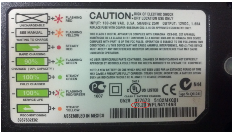
Figure 2: XTS Single Unit charger

MOTOROLA Solutions and the Stylized M Logo are registered in the U.S. Patent & Trademark Office. All other product or service names are the property of their respective owners.